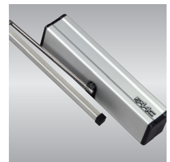
■ Housing in anodised aluminium