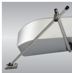
■ On slide arm