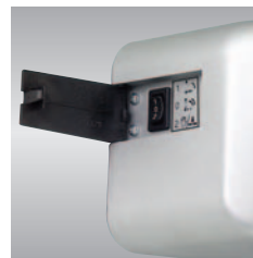
■ Functions selector witch