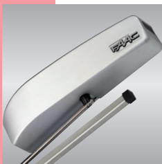
■ 950 BM operator Housing in painted anodised aluminium

This product is not just attractive, but is also sturdy, reliable and, above all, safe. In compliance with current safety regulations, speed and force are programmed according to the door's dimensions. If the door meets an obstacle, it re-opens immediately and, when it closes the next time, it verifies clearance of the obstacle at slow speed.