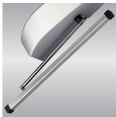
■ Articulated pushing arm